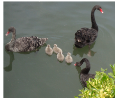
Friends of Riverside Park